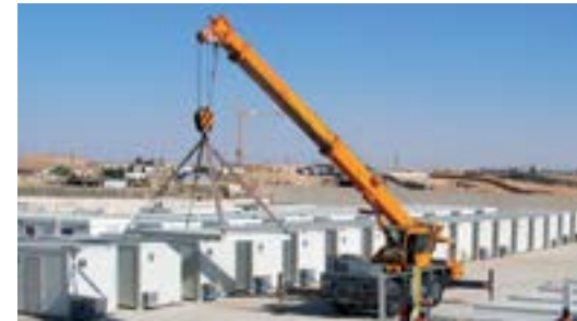
Oil Rig Field Camp Support, Hassi Messaoud, Algeria