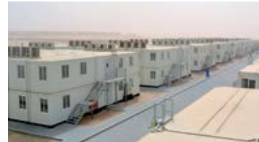
Remote Site Camp, Al Wasita, UAE