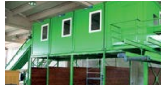
Waste Treatment Center, Krk, Croatia