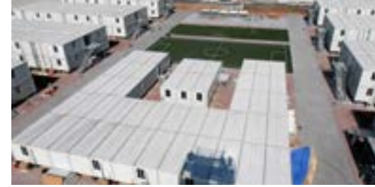
Remote Site Camp Medco, Doha, Qatar