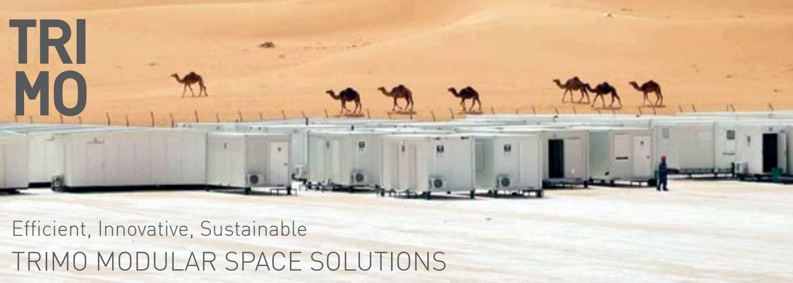
Remote Site Camp, Libya